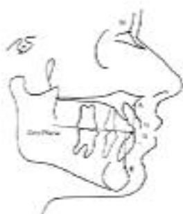
Figure 1: A and B points on the functional occlusal plane