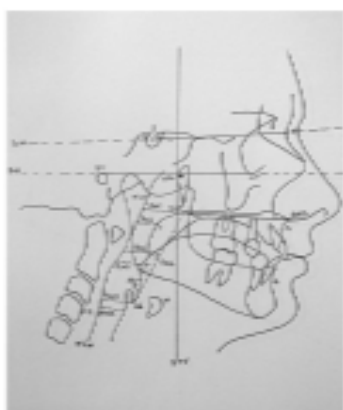
Fig 3: Airway variables used in this study