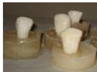
Fig 1: Mounted teeth

The mean shear bond strength of single bond to bleached enamel was 8.36 \pm 3.3 MPa, and that for unbleached enamel was 20.17 \pm 6.52 MPa. With