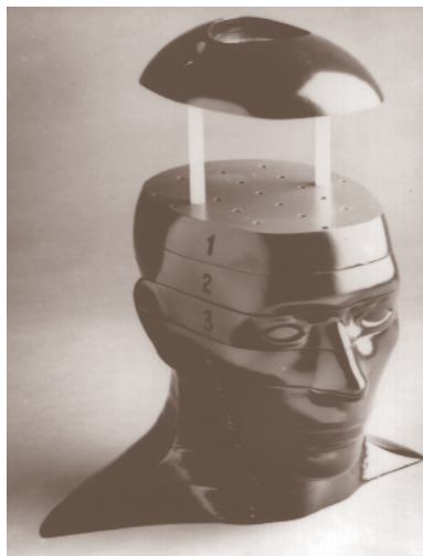
Figure 1. RANDO phantom

In this experimental crossover study a head RANDO phantom (Radiation Analog Dosimetry System, Alderson Research Lab, Inc. Stamford, Connecticut) was used (Figure 1).