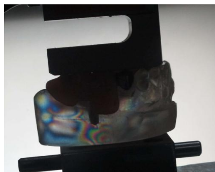
Figure 8. Photoelastic analysis