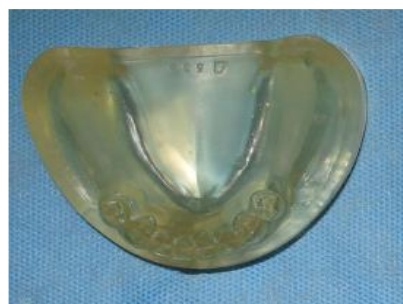
Figure 1. Photoelastic model of mandible

absence of voids or inaccuracies. If the model was not accurate, the respective step was repeated. An index was obtained of abutment teeth using addition silicon impression material and the teeth received chamfer preparation using round-end, taper diamond bur (D & Z, Quezon City, Philippines) according to the silicon impression to standardize the preparation at both sides (although thickness of crowns was not among the confounding factors affecting the results). The accuracy of preparation was ensured by inspection under adequate lighting at x2 magnification. The model was duplicated using silicon (Elite Zhermack, Badia Polesine, Italy) and the mold was poured with two different consistencies of photoelastic resin such that 5 mm was poured by hard-set resin (PI1 2152 Hardner:1 Ghafory Co., Tehran, Iran) and the rest was poured with medium-set resin (PI1 2152 Hardner: 2; Ghafory Co., Tehran, Iran) to simulate the difference between crestal bone density and that of other parts of bone (Figure 1).