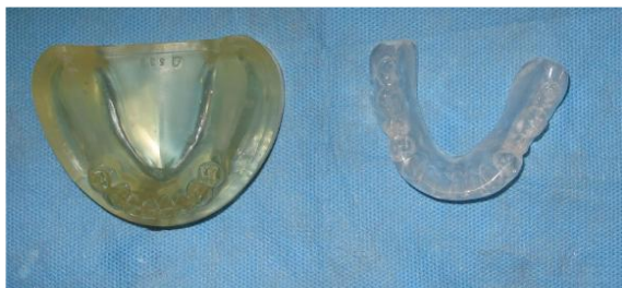
Figure 2. Surgical stent prepared for standardized placement of dental implants in edentulous areas

diameter and 11 mm in length were chosen to be placed at the site of first molars (at 12 mm distance from the prepared tooth). Ankylosis system comes with prefabricated telescopic crowns (Friadent GmbH, Molndal, Sweden); thus, this system was used to decrease human and laboratory errors. Also, two implants with the afore-mentioned dimensions were placed bilaterally since in the posterior mandible, bone width is often adequate but bone height is often inadequate due to bone loss and presence of inferior alveolar canal. Implants were placed at 12 mm distance from the center of prepared teeth using a surgical guide and surveyor after drilling (Figure 3).