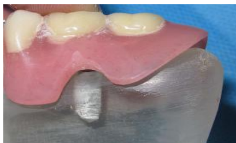
Figure 7. Partial denture fabricated on the model for photoelastic analysis