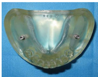
Figure 3. Photoelastic model of mandible with implants placed in edentulous areas

diameter and 11 mm in length were chosen to be placed at the site of first molars (at 12 mm distance from the prepared tooth). Ankylosis system comes with prefabricated telescopic crowns (Friadent GmbH, Molndal, Sweden); thus, this system was used to decrease human and laboratory errors. Also, two implants with the afore-mentioned dimensions were placed bilaterally since in the posterior mandible, bone width is often adequate but bone height is often inadequate due to bone loss and presence of inferior alveolar canal. Implants were placed at 12 mm distance from the center of prepared teeth using a surgical guide and surveyor after drilling (Figure 3).