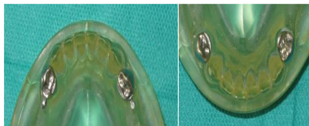
Figure 4. Prepared crowns with attachment on tooth abutments

full-metal crown in non-rigid (no attachment) type had a lingual ledge (Figure 4). In designing full-metal crowns with attachments, a rigid extra-coronal attachment was used. The attachment pattern was connected to the wax pattern using a surveyor according to the edentulous ridge and cast. After preparation of crowns and their placement on photoelastic pattern, their fit was assessed using Fit Checker (GC, Alsip, USA) (Figure 4).